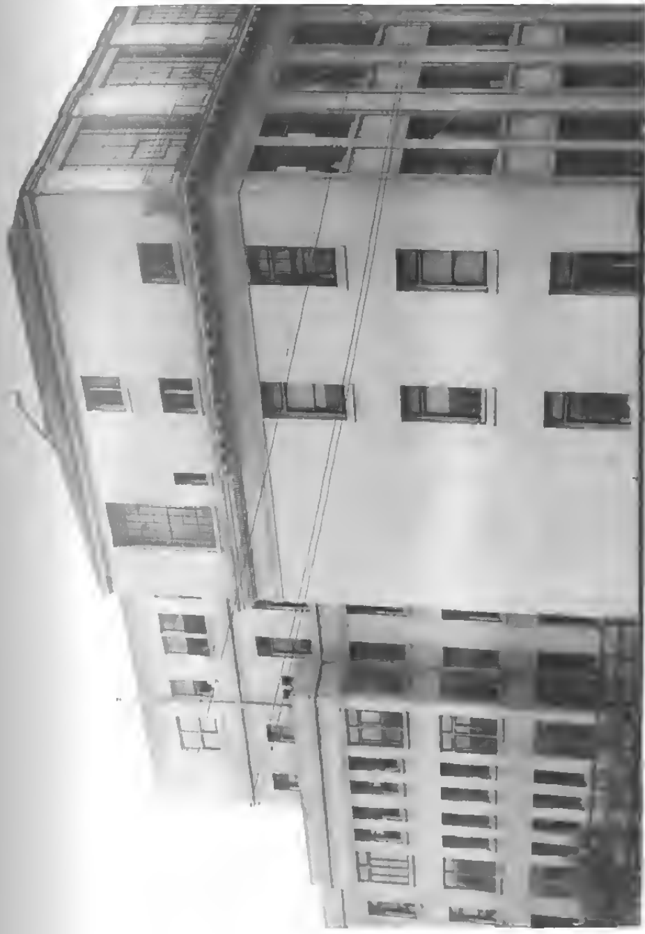
Stanford University Hospital